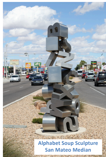
Alphabet Soup Sculpture San Mateo Median

The east and south sides of the library, adjacent walkways and the nearby San Mateo traffic median are all sites of a public art installation titled, "Alphabet Soup." Pete Beeman, the creator of the art noted that letters are the building blocks of our language, of our learning and of our civilization and in his installation they swarm out of the library into our lives. Pete is a Portland based artist who has done other large scale public art projects, many of them quite delightful. You can see photos of some of his other