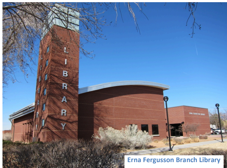
Erna Fergusson Branch Library

Crossing Comanche Road, you enter Montgomery Park. This is a spacious facility with grass, trees, swings, playing fields, and tennis courts. Parking is available on the east side of the park off Comanche Road--just east of where the trail crosses Comanche. Curbside parking