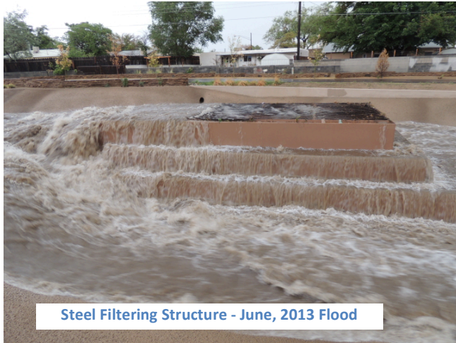
Steel Filtering Structure - June, 2013 Flood

speed spread out from the pebble. Now imagine throwing a pebble into a moving stream. If the stream flow is slower than the speed at which the waves spread from the pebble, these waves will continue to spread downstream and upstream, albeit more slowly upstream. But if stream flow moves faster than the pebble's waves, the waves will spread downstream only. Stream flow which moves slower than the speed of its waves is said to be subcritical while water moving faster is said to be supercritical. Water at supercritical flow has substantially more energy than subcritical flow.