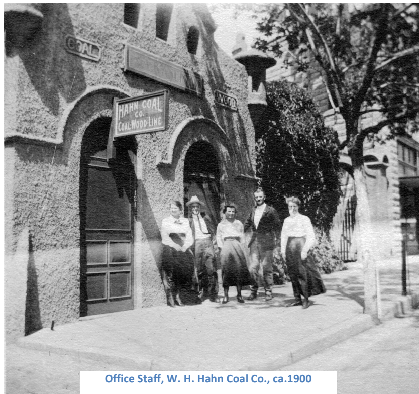
Office Staff, W. H. Hahn Coal Co., ca.1900