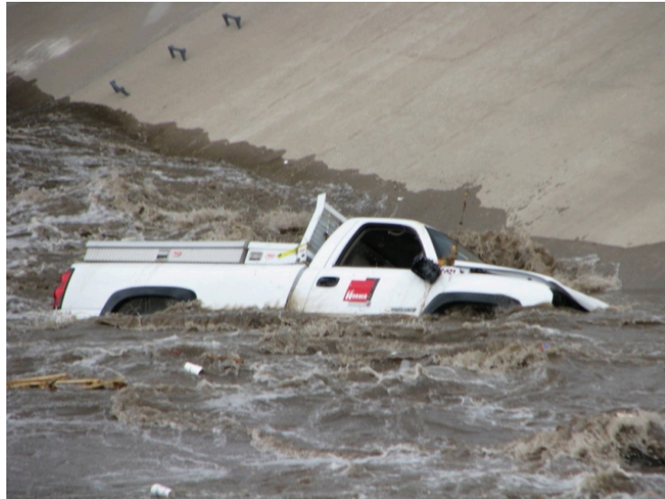
A Service Vehicle Was Caught In The North Diversion Channel During The Flood Of 2013

This is the end of the tour. If you have time, consider exploring some of the trail along the North Diversion